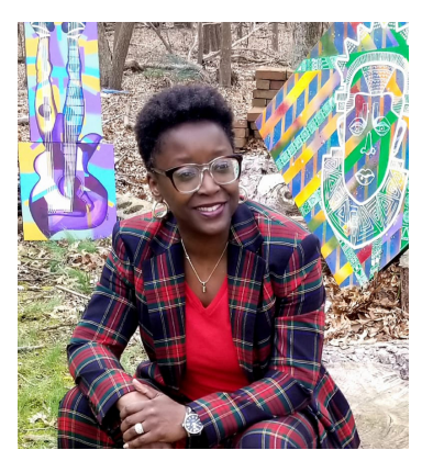
that exist in our society.