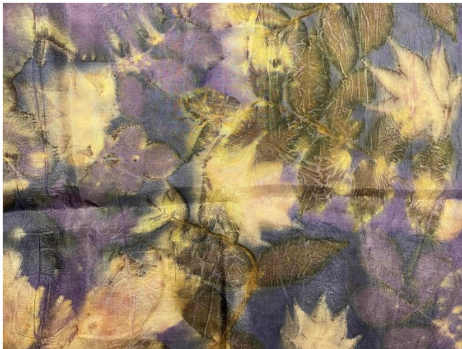
Oksana Danziger Imprints of Nature 2 Eco Printed Scarf, 20" x 20"