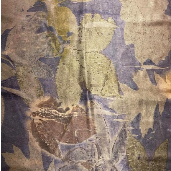
Oksana Danziger Imprints of Nature 1 Eco Printed Scarf, 20" x 20"